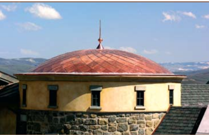
Installation by Nielco Roofing and Sheet Metal